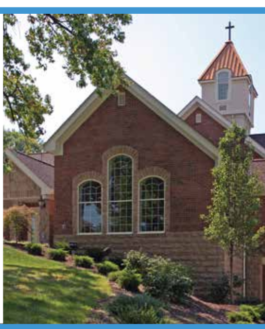
Ohio Living chapels throughout the state of Ohio on the campuses of Ohio Living Westminster-Thurber, Llanfair and Breckenridge Village.

Ohio Living communities are filled with love; you can feel it. That's because we make it part of our mission to care for the spiritual well-being of each person we serve. We understand that living each day according to the values and beliefs that have been lifelong anchors is important to you.